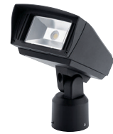
Slip-Fit Mount (SL) 2" trade size for post mount