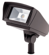
Knuckle Mount 1/2" NPSM trade size fittings