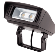
Trunnion Mount (TR) Surface mount for variety of different mounting options.